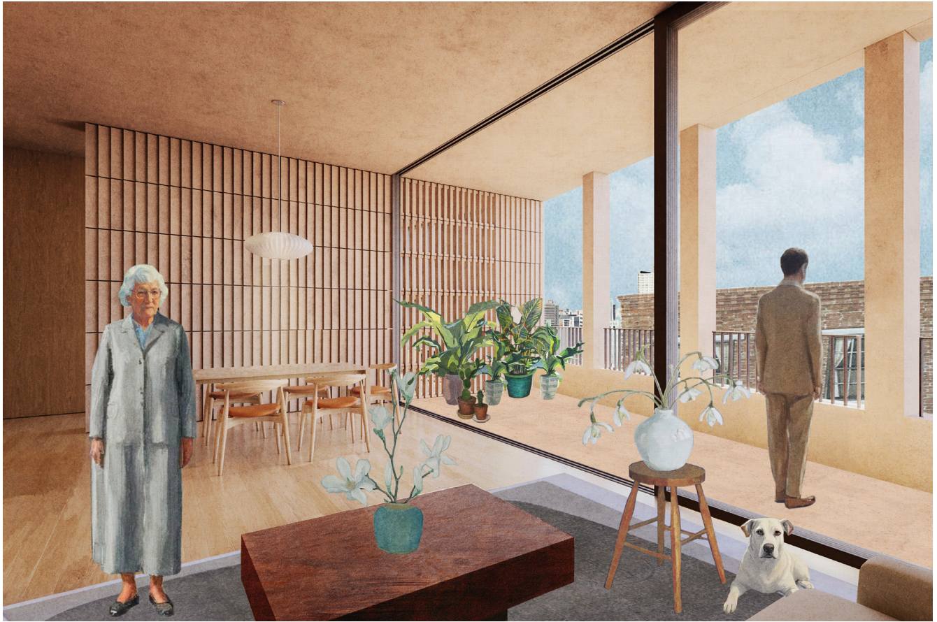
BERGEN BROOKLYN — BROOKLYN, NYC, USA 2024 INTERIOR APARTMENT WITH THE EXTERIOR TERRACE